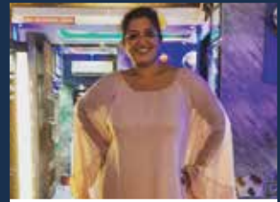
Supriya Guru Production at Drishyam Films